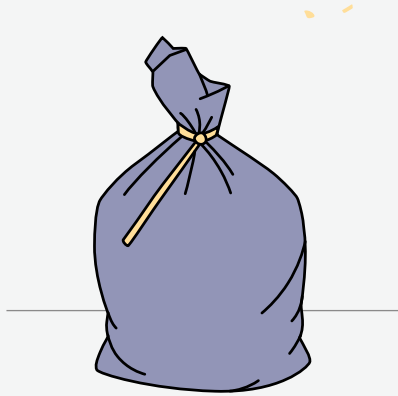
✓ Correctly filled bag