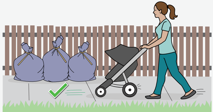
Correctly placed bags