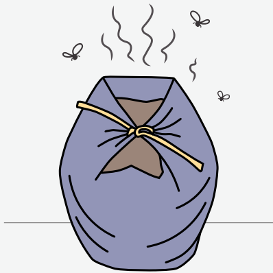
✗ Incorrectly filled bag